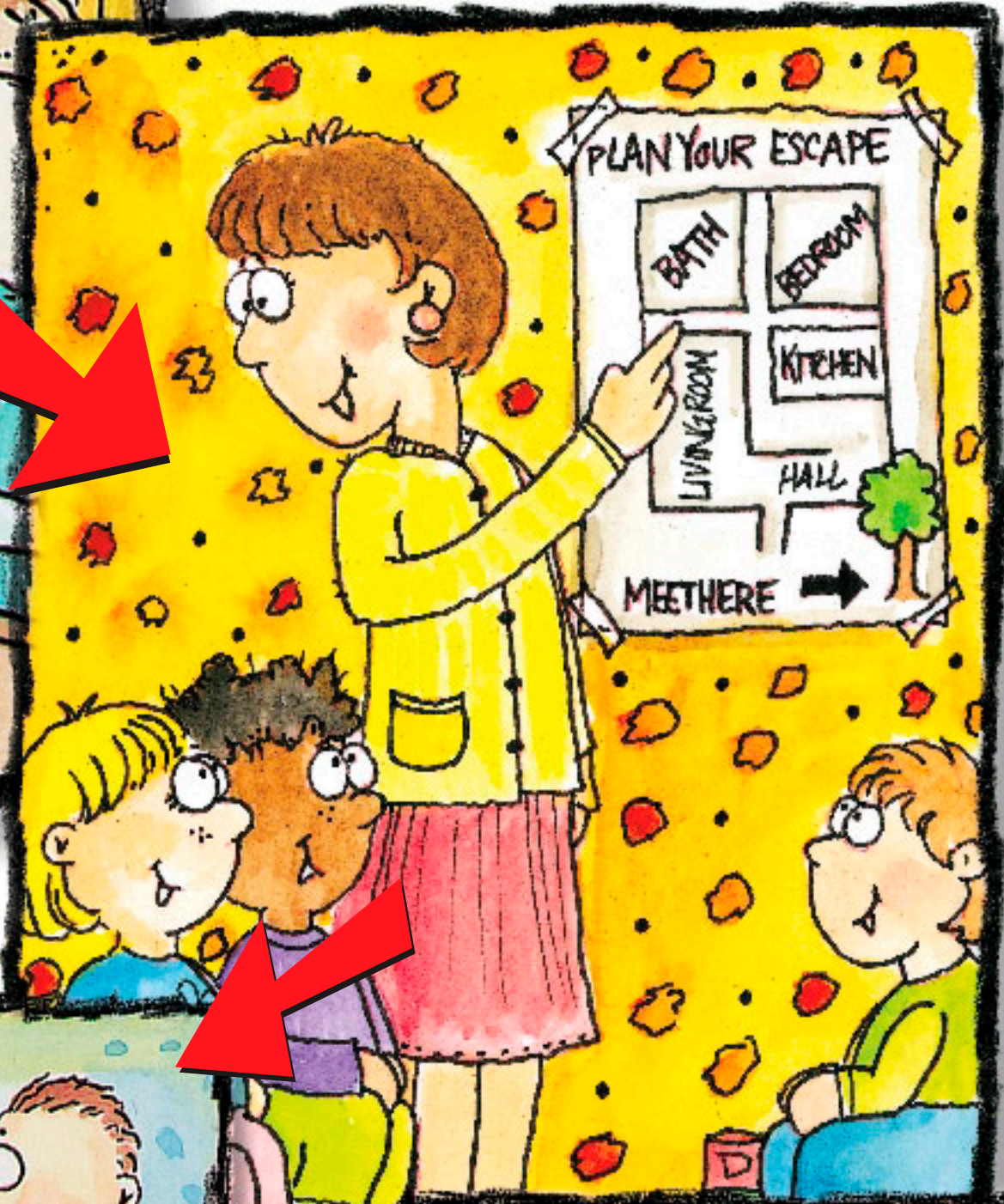
STEP 2 Draw a floor plan of your home