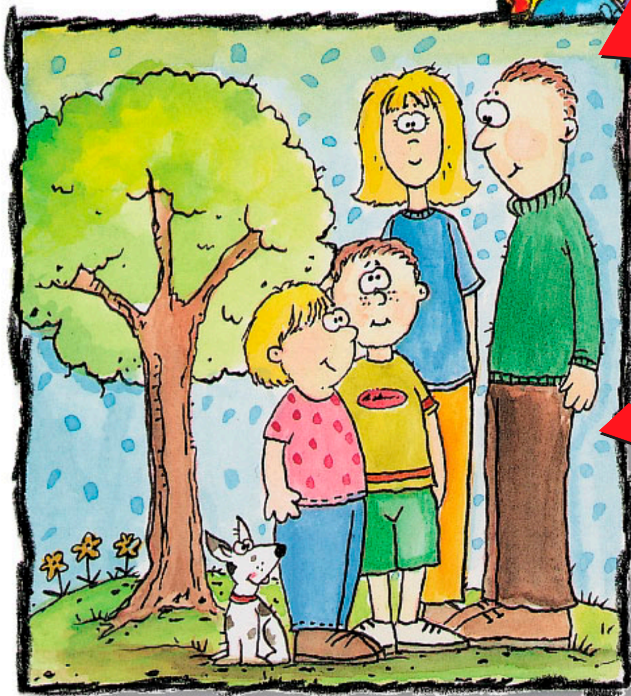
STEP 3 Choose a family meeting place