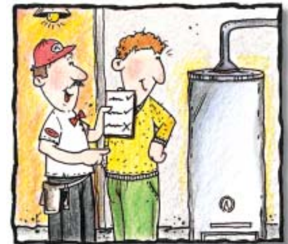
Have regular inspections