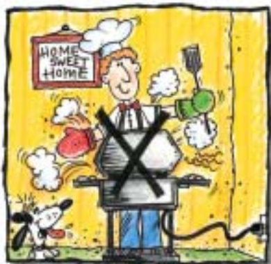
Don't barbecue indoors!

Work together to minimize the production of CO in your home.