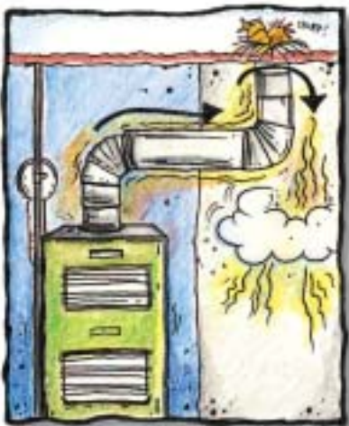
Blocked furnace vent

including adding new windows and additional insulation, consult a qualified heating contractor. Changes may upset the operation of existing appliances.