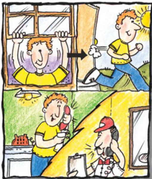
Smell gas... act fast!

Natural gas is one of the safest fuels. Composed mostly of methane, it is naturally colourless and odourless. For safety's sake, an odour is added - a smell like rotten eggs or sulphur - so you can easily detect it. When natural gas leaks it will mix with air and can cause a fire if there is a source of ignition (or explosion if it accumulates in a confined space). Natural gas is not poisonous but can cause unconsciousness in high concentrations when it displaces air.